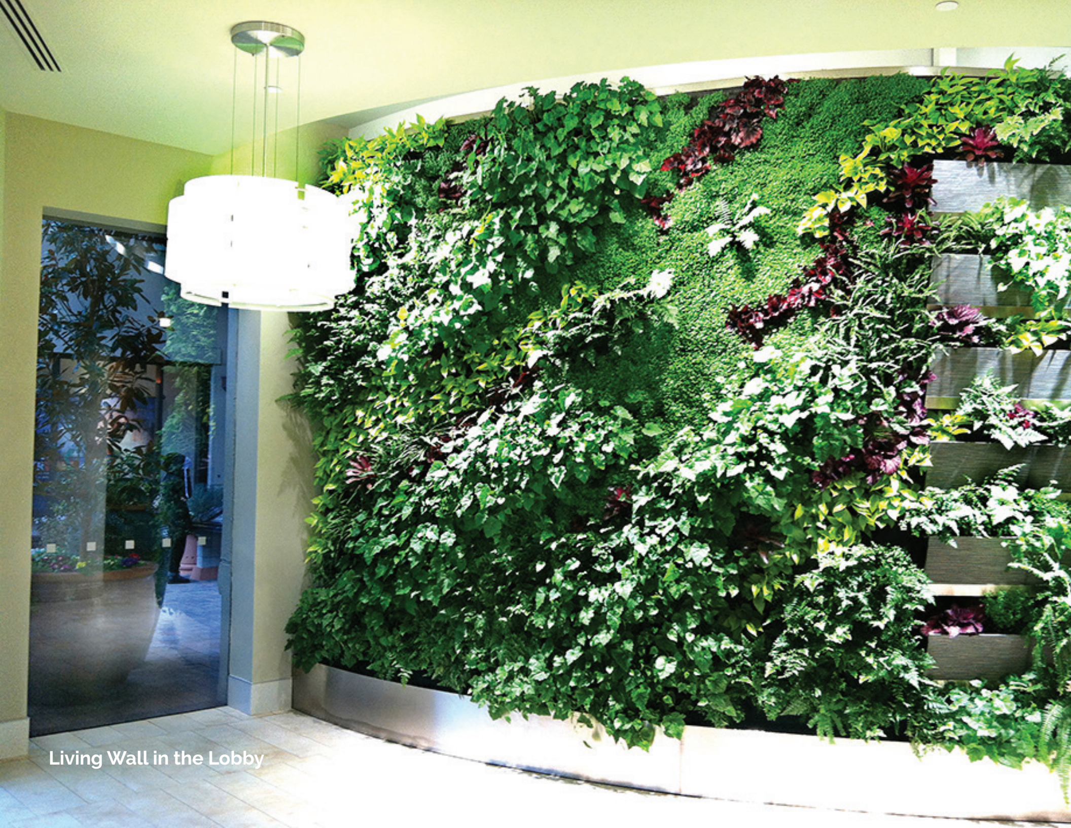
Living Wall in the Lobby