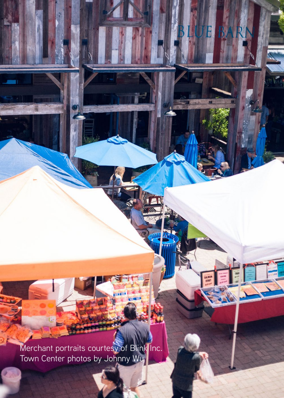
Merchant portraits courtesy of Blink Inc. Town Center photos by Johnny Wu